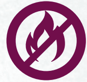
Non - flammable