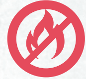
Non - flammable